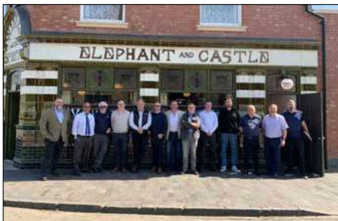
DCS Council members and those attending the AGM enjoy the delights of the Black Country Living Museum